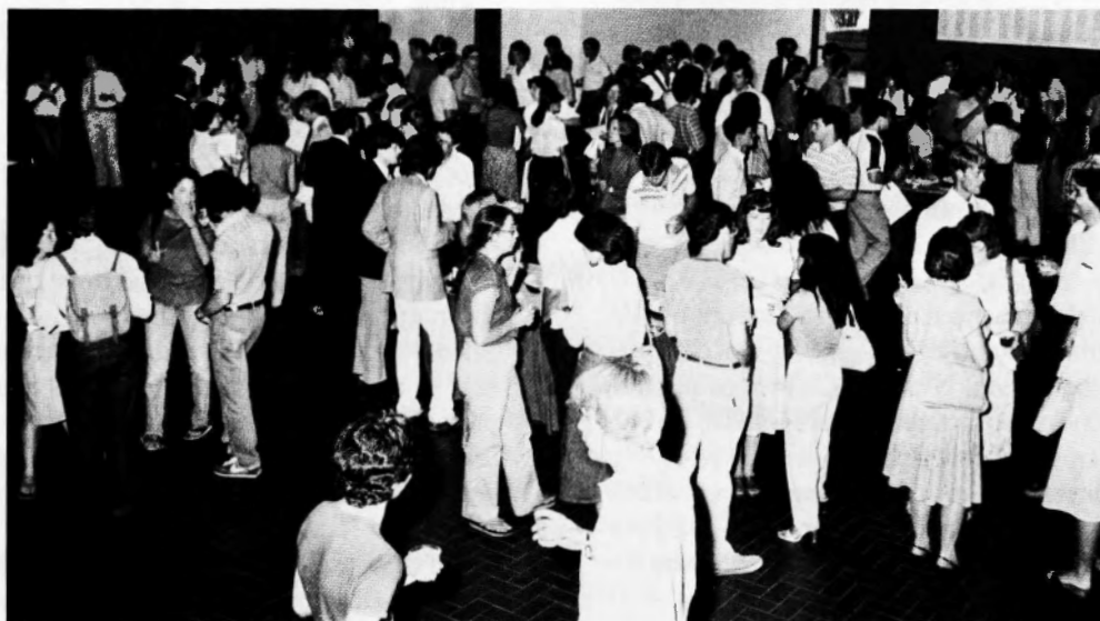
Some of the first year students on Orientation Day, 1980

The generosity of the firms which have agreed to support this new journal cannot be gainsaid. We are certain that the new journal will become one of the leading publications of its kind in the United States.